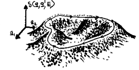
Figure 34.2: A romanticized sketch of S_p(E) = S(q, q, E) = \oint p(q, E) dq landscape orbit. Unstable periodic orbits traverse isolated ridges and saddles of the mountainous landscape of the action S(q_{||}, q_{\perp}, E) . Along a periodic orbit S_p(E) is constant; in the transverse directions it generically changes quadratically.

meaning that the initial and final momenta (33.40) of contributing trajectories should coincide